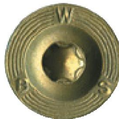
FIGURE 2. BIG TIMBER® CTX CONSTRUCTION LAG SCREW HEAD MARKINGS